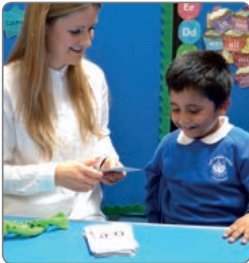
Learning the Speed Sounds in the classroom.