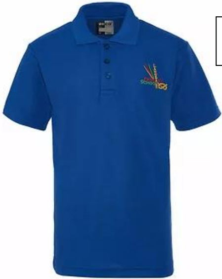
Blue polo shirt