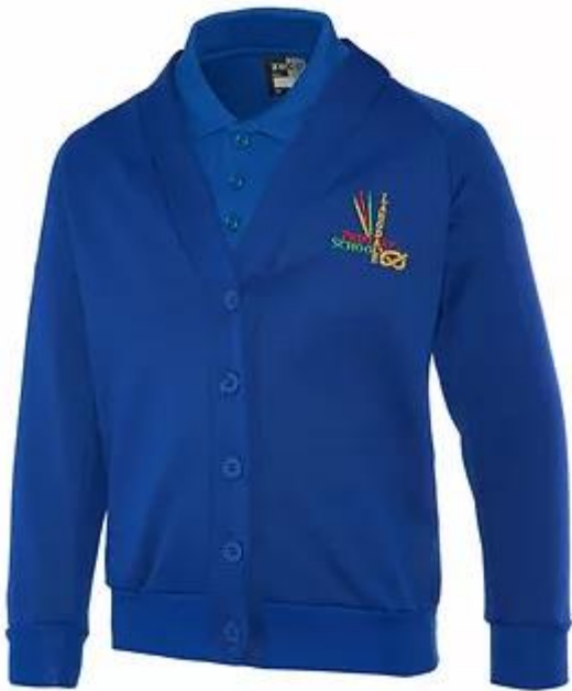
Blue cardigan and blue polo shirt