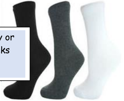
Black, grey or white socks