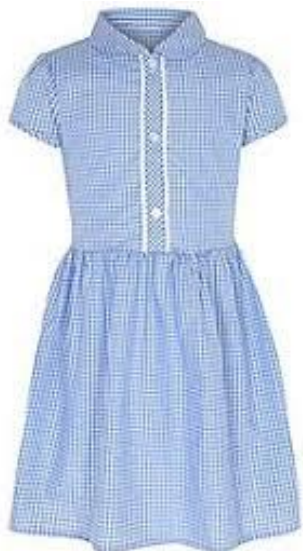
Blue and white gingham summer dress