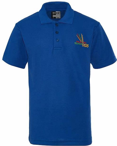
Blue polo shirt