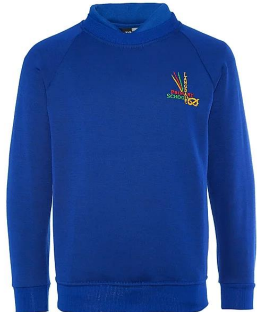
Blue jumper and blue polo shirt